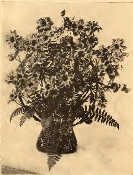
NEW COLLARETTE DAHLIA CONTINENTAL