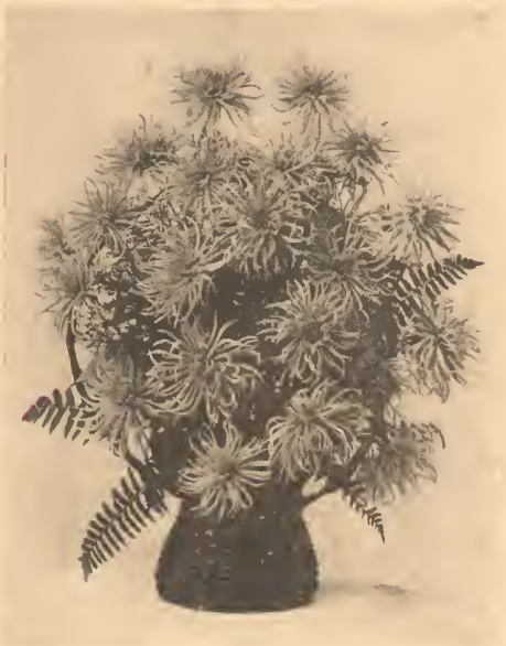
CACTUS DAHLIA Pink Abundance